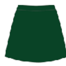
SK-SP01 Cotton Elastane Skort Bottle C4-C14 $25.00