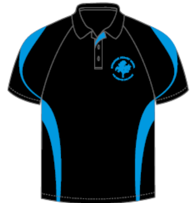
GRADE 6 BELL POLO - BLACK/AQUA