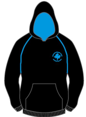
GRADE 6 CONTRAST HOODIE - BLACK/AQUA