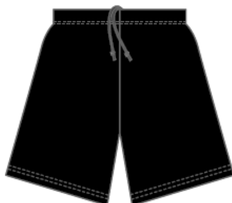
JERSEY SHORTS - BLACK $22.00-$24.00