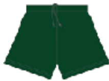
SH-RH03 Gabardine Shorts Bottle C4-C16 $22.00