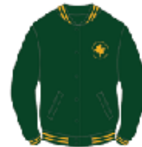
BYS-BJWS02 (Child) Bomber Jacket Bottle / Gold C6-C12 $40.00