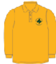
BYS-PLLW01 Long Sleeve Polo Gold C4-C16 $26.00