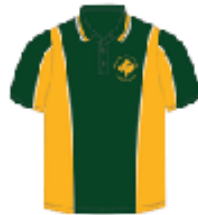
BYS-PSBW02 (adult) Short Sleeve Polo Bottle / Gold / White XS-3XL $27.00