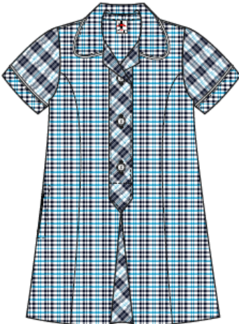
SUMMER DRESS - WHITE/INK NAVY/AQUA