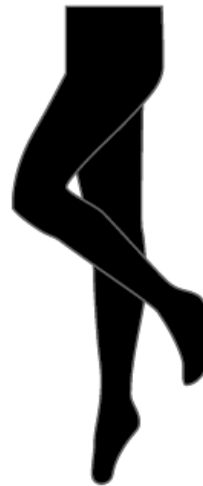
COTTON BLEND TIGHTS - BLACK $12.00