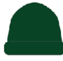
HA-LW02 Polar Fleece Beanie Bottle One Size $10.00