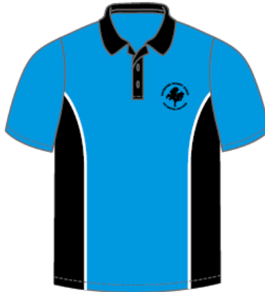
CUSTOM PANEL POLO - AQUA/BLACK/WHITE $39.00-$41.00