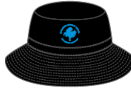
MICROFIBRE BUCKET HAT - BLACK $14.00