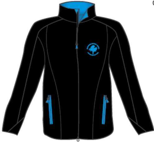
GENEVA SOFTSHELL JACKET - BLACK/CYAN $70.00