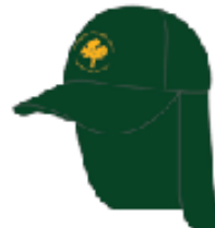
BYS-HARH04 Legionnaire Hat Bottle One Size $12.00