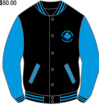
CUSTOM BOMBER JACKET $46.00 - $50.00