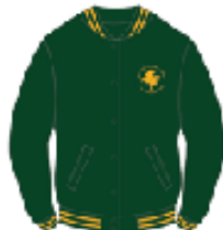
BYS-BJWS03 (Adult) Bomber Jacket Bottle / Gold 3XS-3XL $42.00