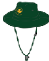
BYS-HARH01 Slouch Hat Bottle S, M, L, XL $14.00