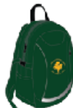
BYS-BARH Nyda Active Pak School Bag Bottle One Size - 25LT $45.00