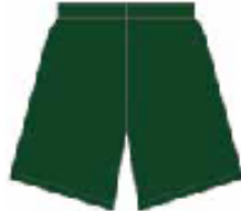
SH-RH01 Jersey Shorts Bottle C4-C16 $22.00