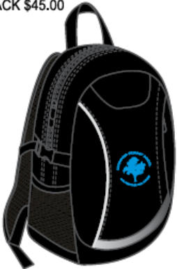
NYDA ACTIVE PAK SCHOOL BAG - BLACK $45.00